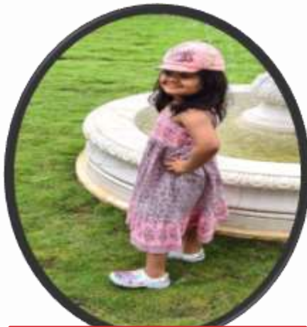
MISHIKA - PS-D