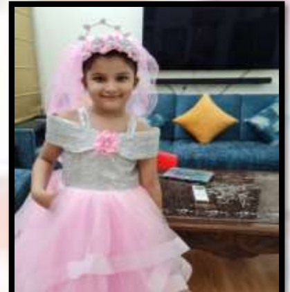
ANAYA – PP-D