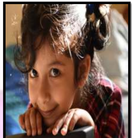
KRISHA – PP-D