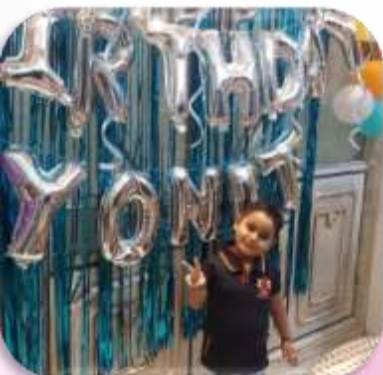
Yonit - PS- B