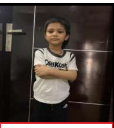
YANISH – PP-B