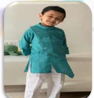
VIHAAN -PS -B